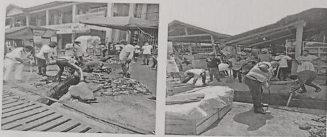
Figure 1: Pictures Showing Clean Up Exercise at Central Business Areas